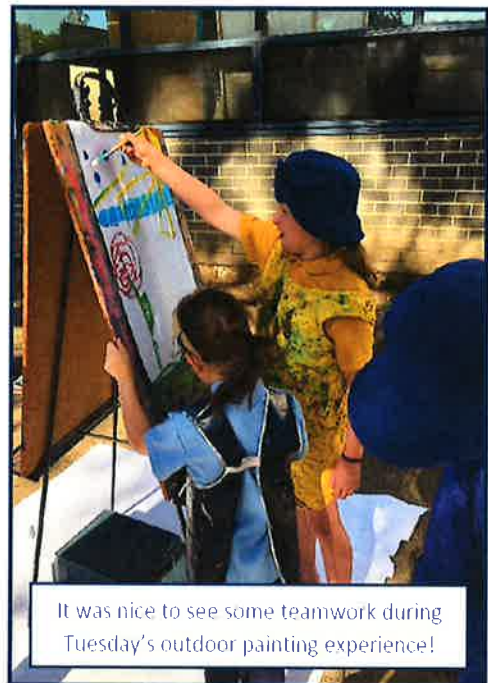
It was nice to see some teamwork during Tuesday's outdoor painting experience!